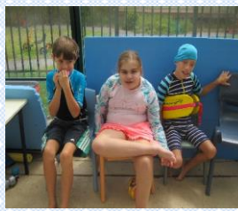
Magura kids sitting and waiting for instructions before going in the water