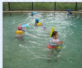
Magura class practicing skills in the water