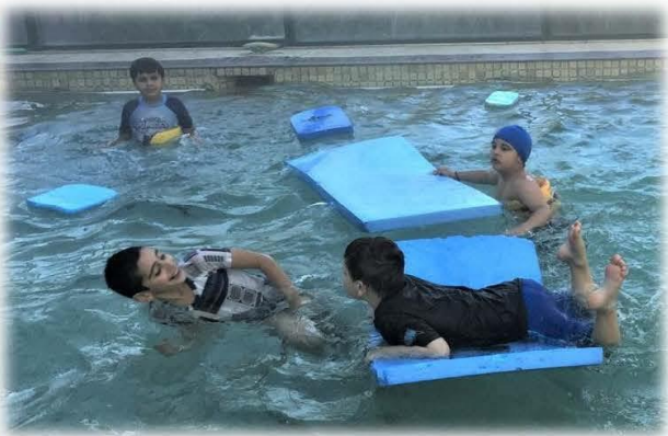
Swimming is so much fun when together with friends.