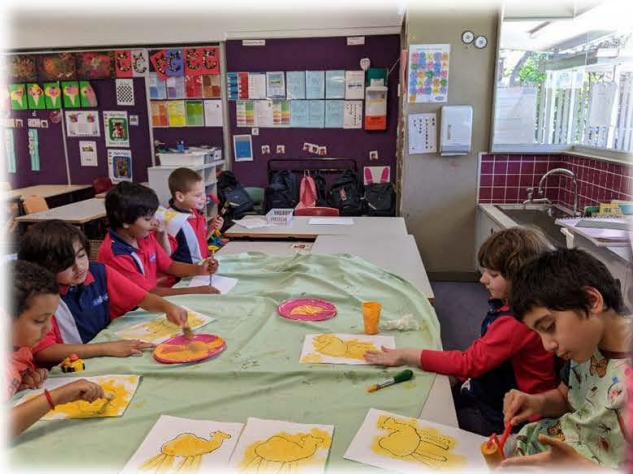
Bembul students enjoy painting and being together with their friends.

This year, Bembul students have been learning to work and play together as a class! They have learned to take turns and share with each other. Bembul students had a great semester. Well done Bembul!