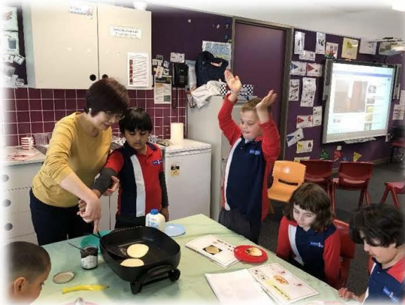
Bembul students waiting for their turn when working as a class.