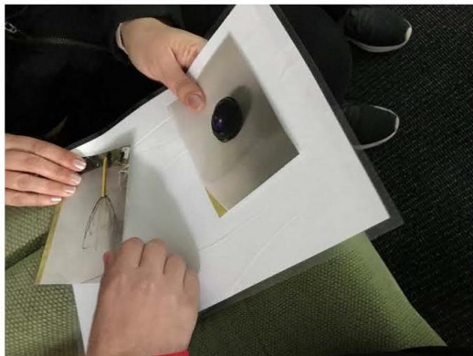
Sascha choosing the massage tool she would like from photographs.